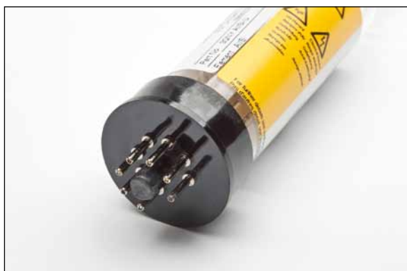
37 mm Thermo Coded