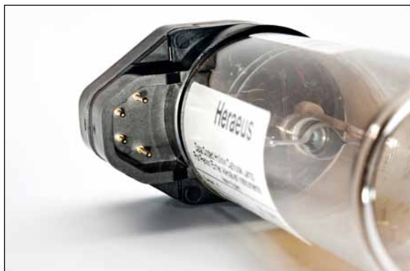
50 mm PE coded Analyst

A variety of base designs is available for Heraeus Hollow Cathode lamps.