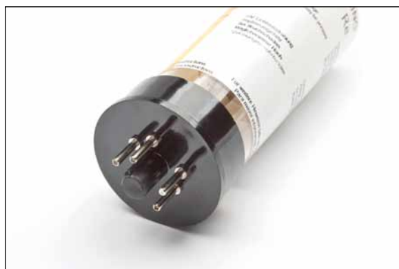
37 mm Varian Coded