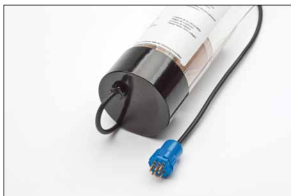
50 mm Standard