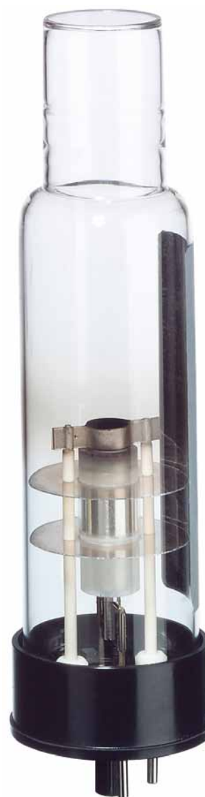
37 mm Hollow Cathode Lamp

Heraeus manufacture and supply a complete range of data coded hollow cathode lamps for Varian, Perkin Elmer and Thermo instruments.