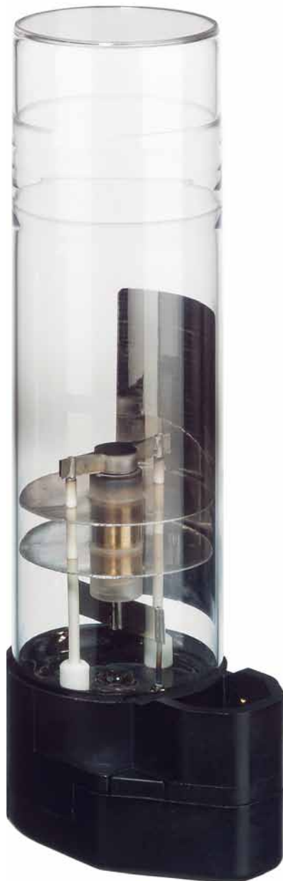
50 mm Hollow Cathode Lamp

Data coded hollow cathode lamps incorporate a unique electronic configuration in the base or plug which the instrument recognizes and sets default operating conditions for the routine analysis of that element. The parameters may be overridden by the operator if desired to suit the specific requirements of the analysis. The electronic configuration of the data coding is also specific to each instrument manufacturer and not interchangeable i.e. a Varian coded lamp will not register in a Thermo instrument. Heraeus offers a full range of coded lamps for each manufacturer, the exact range being governed by the software embedded in the instrument.