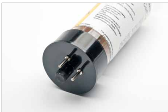
37 mm Standard, 37 mm Self Reversal