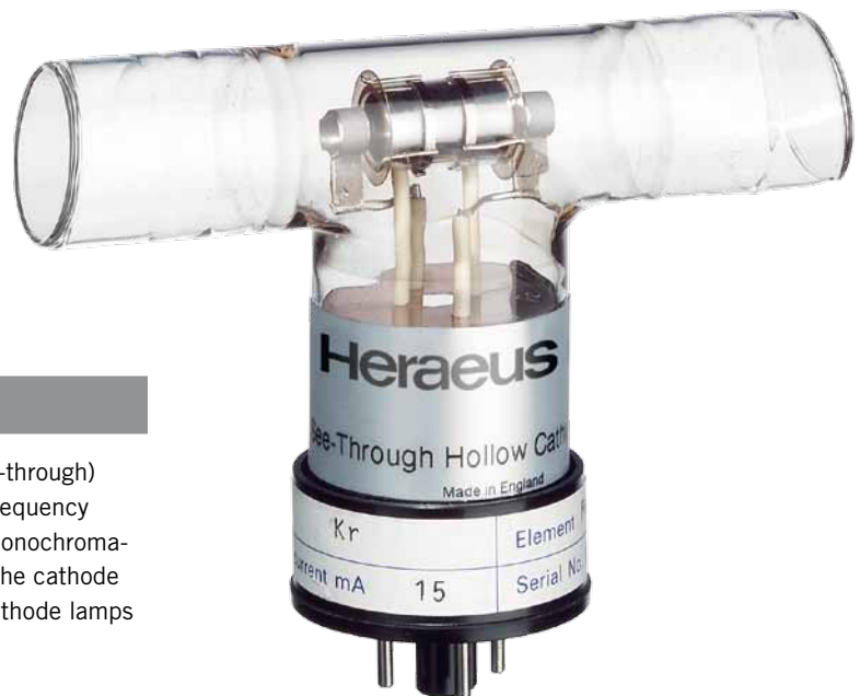
See-Through Hollow Cathode Lamp

Heraeus also manufactures optogalvanic (see-through) hollow cathode lamps, designed to act as a frequency stable reference for high intensity tuneable monochromatic light sources, particularly lasers. Most of the cathode materials used in standard Heraeus hollow cathode lamps may be used in the “see-through” design.