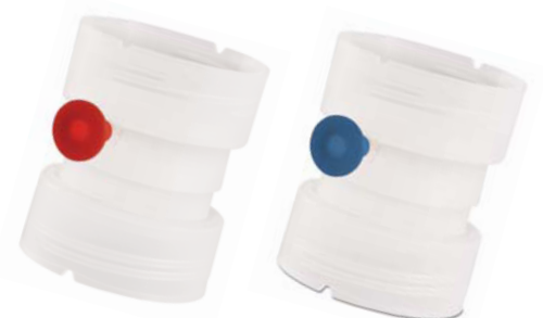
Catalogue Number: 010-500-070